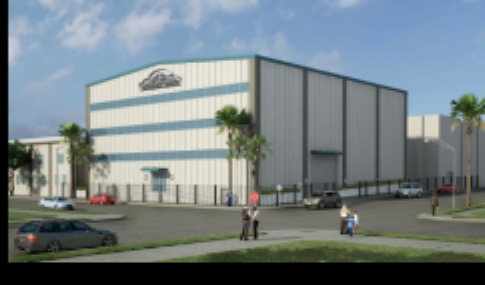
201 North Occidental Boulevard Hollywood, CA

Hollywood's newest, sound stage is 14,000 square feet, 54 feet high, and includes another four floors of 6,000 square feet high end office space, hair & make-up facilities, dressing rooms, production offices, kitchens, conference rooms, totaling 20,000 square feet in this four story production center.