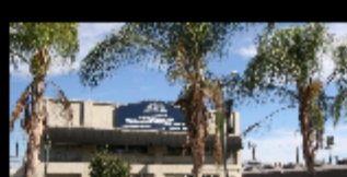
1136 N. Highland Avenue Hollywood

High Identity, Great Street Frontage, Exposure and Signage. Located in the heart of the Hollywood Media District, 1136 North Highland hosts 8,500 square feet with an attached gated 29-car parking lot. The building features a sound stage and production offices encased in brick walls with a bow truss ceiling. Owner will participate in any creative office use conversion.